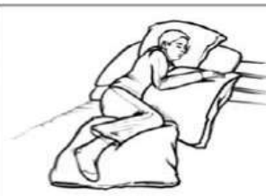
Adapted forward lean for lying