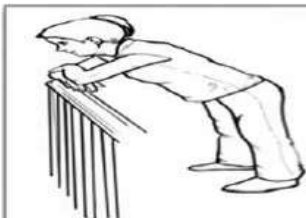
Forward lean 1

Minimise stock wastage. If available, consider if a syringe driver is helpful If subcutaneous administration not possible, consider alternative routes e.g. buccal, rectal, transdermal